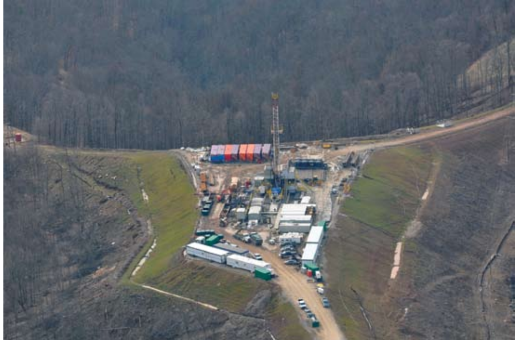
Fracking imposes a range of environmental, health and community impacts. Above, a fracking well site is built in a forested area of Wetzels County, W.Va.

draulic fracturing, to operate that well, and to deliver the gas or oil extracted from that well to market.